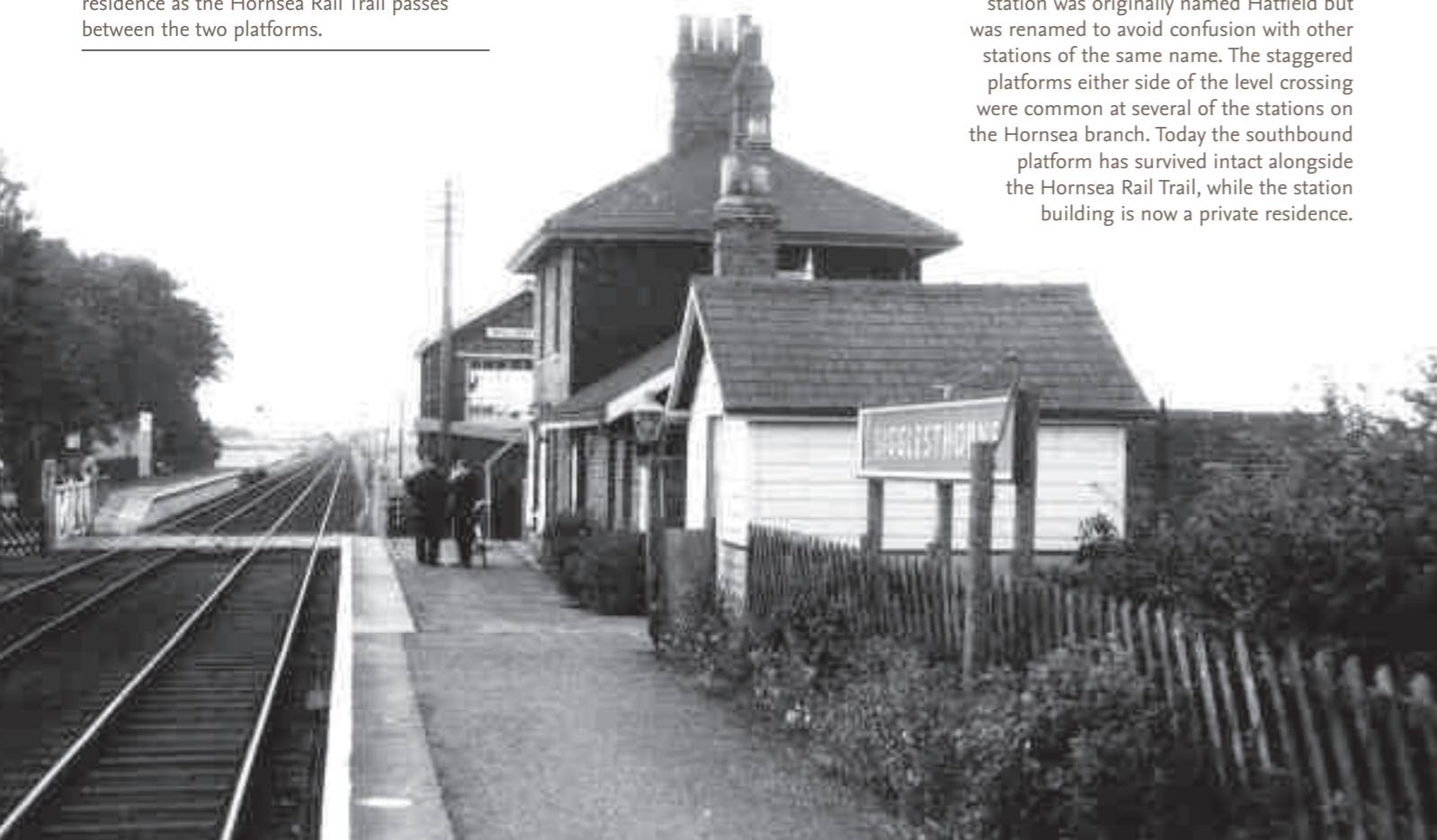
BELOW: Station staff pass the time of day at Sigglesothorne station in August 1956. The station was originally named Hatfield but was renamed to avoid confusion with other stations of the same name. The staggered platforms either side of the level crossing were common at several of the stations on the Hornsea branch. Today the southbound platform has survived intact alongside the Hornsea Rail Trail, while the station building is now a private residence.

Since closure, almost the entire route of the branch line from Wilmington in Hull to Hornsea has been reopened as a traffic-free footpath and cycleway known as the Hornsea Rail Trail. It also forms part of National Cycle Network Route 65 and the Trans-Pennine Trail.