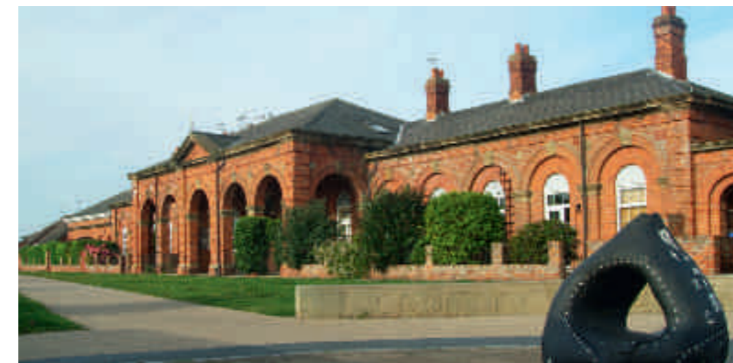
The attractive red-brick station building at Hornsea has been restored as private residences while in the foreground a piece of modern sculpture marks the start of the Trans-Pennine Trail to Southport.

From Sigglesothorne the level and straight Trail continues towards Hornsea passing the 'market days only' station of Wassand, now a private residence. It was originally named Goxhill but was renamed in 1904 and closed to passengers in 1953. Continuing northeastwards, the Trail enters a long cutting before passing the site of the demolished Hornsea Bridge station and ending in style at the superbly restored red-brick Hornsea Town station. Although the elegant canopy and platforms have long gone, the station buildings are now used for housing. In front of the station there is a paved area with a modern sculpture celebrating the end (or start) of the Trans-Pennine Trail from Southport. Car parking and the delights of Hornsea seafront are but a short distance away.