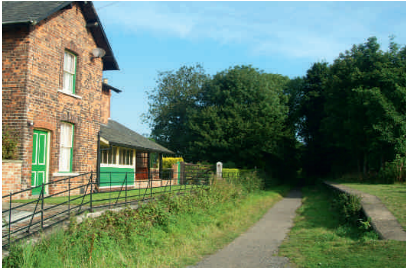
ABOVE: Whitedale station building has been sympathetically restored and is now a private residence as the Hornsea Rail Trail passes between the two platforms.