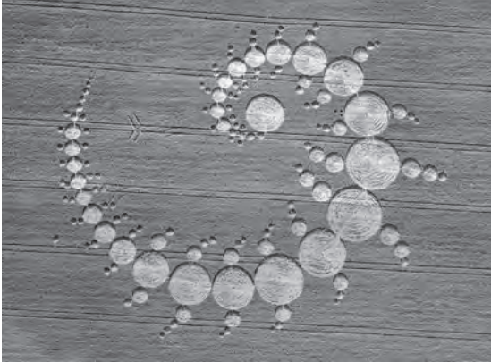
The Julia Set crop circle.

The neurologist in this room was trying to work out why the pilot's brain had failed to spot the circle the first time around. It had been there all along, having been built the previous night by a group of conceptual artists known as Team Satan using planks of wood and string.