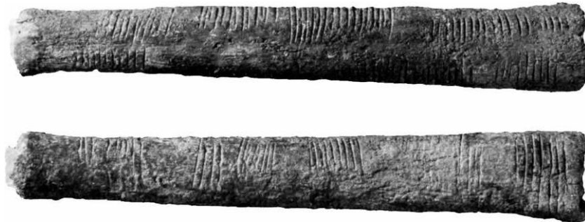
Fig 1 Front and rear of Ishango bone in the Museum of Natural Sciences, Brussels.

It's certainly intriguing. There are three series of notches. The central series uses the numbers 3, 6, 4, 8, 10, 5, 7. Twice 3 is 6, twice 4 is 8, and twice 5 is 10; however, the order for the final pair is the other way round, and 7 doesn't fit the pattern at all. The left-hand series is 11, 13, 17, 19: the prime numbers from 10 to 20. The right-hand series supplies the odd numbers 11, 21, 19, 9. The left- and right-hand series each add to 60.