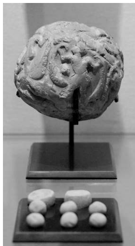
Fig 3 Clay envelope and accountancy tokens, Uruk period, from Susa.

Then one bright spark realised that the symbols made the tokens redundant. The upshot was a system of written number symbols, paving the way for all subsequent systems of number notation, and possibly of writing itself.