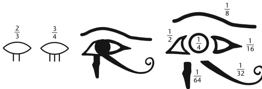
Fig 4 Left: Egyptian hieroglyphs for \frac{2}{3} and \frac{3}{4} . Middle: Wadjet eye. Right: Fraction hieroglyphs derived from it.

The next big step forward in the enlargement of the number system was to introduce fractions. These are useful if you want to divide some commodity among several people. If three people get equal shares of two bushels of grain, each receives \frac{2}{3} of a bushel.