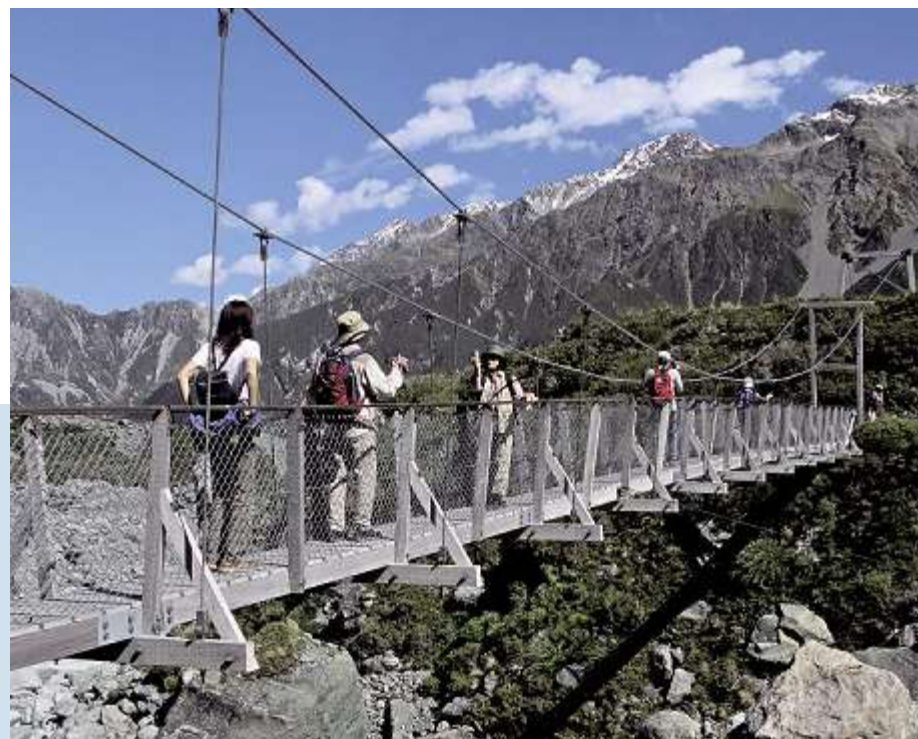
Floating along on a high bridge

Whakatane, alongside the old Maori settlement of Opotiki. Travellers with a bit of time on their hands might consider side trips to the beach at offshore Mayor Island or the still very young and active volcanic outcrop of White Island with its moon-like landscape.